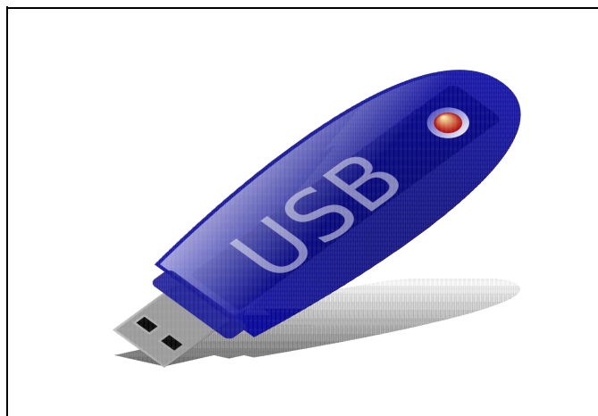
Figure 1: you can run GRUB on a USB flash memory key!