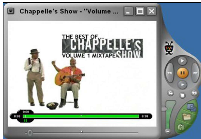
A screenshot from Tivo's Windows-only beta client

If such a system existed, would it be a compelling alternative to existing proprietary rights management packages?